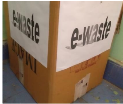
Recycle in action