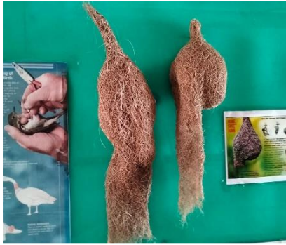
Bird nests for biodiversity conservation