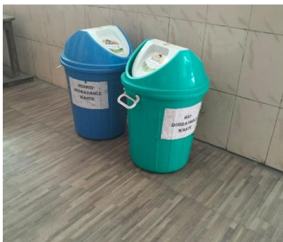
Color coded dustbin