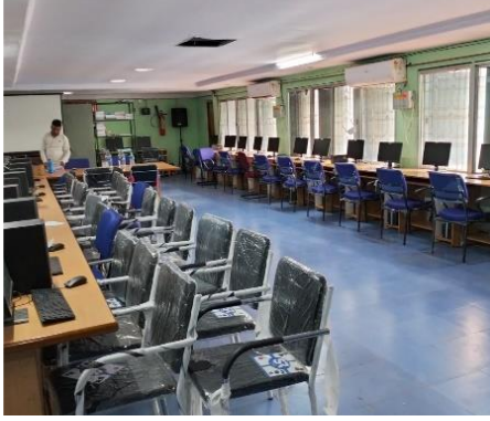
Well equipped labs